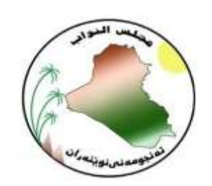
Finance Committee in the Iraqi Perelman